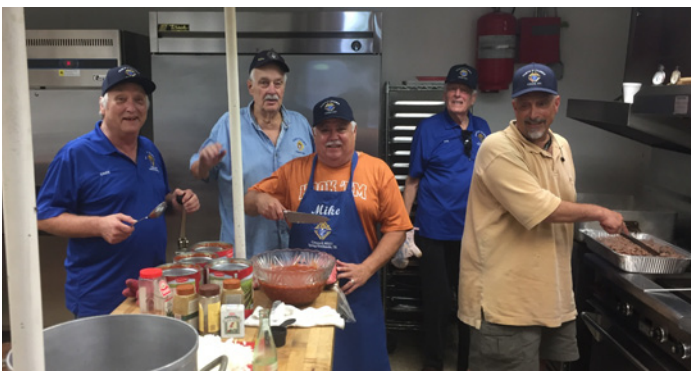
Spring Forest Food Delivery

The kitchen staff hopes all Brothers are enjoying the meals that are prepared for business night and family night. Please remember that on Family Night, please bring a side dish or dessert. Your help is greatly appreciated. Brothers, if you enjoy the KC dinners, please do not forget to leave a donation in the “kitty”.